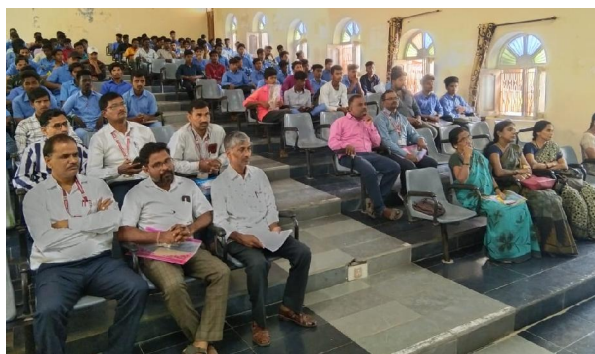
Fig 25. Paritipants in the programme