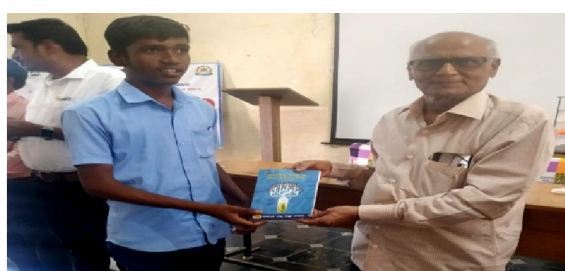
Fig 50. Distribution of books to the students.