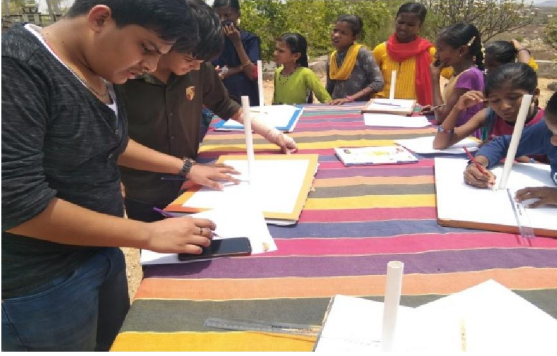
Fig 3: Students experimenting to determining the time of Zero Shadow moment