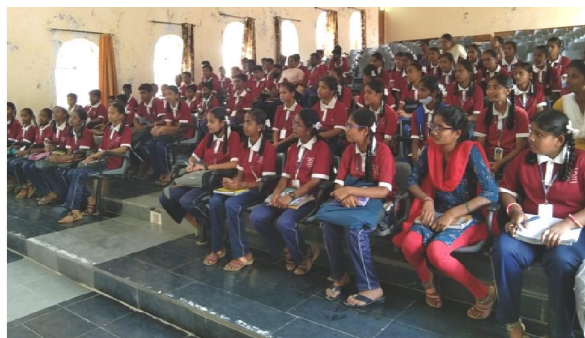
Fig 45. Participants in the programme

The programme was conducted on 07.02.2023 for students of SGG Sanbal School, Raichur. A total of 66 students participated in the programme. In this programme the practical demonstration related to 10 th std SSLC science subject was done. This programme was sponsored by KSTePS, Bengaluru. The budget spent was Rs. 11084/- .