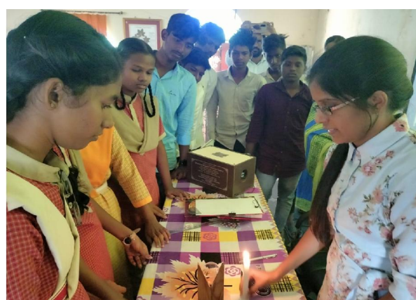
Fig 42. Demonstration of virtual and real image formation through lens