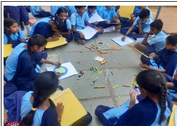
Fig 37. Students participating in the mathematics model workshop at Governemnet Higher Primary School Gundagurthi of Devadurga Taluk

The programme was conducted during the period 22.12.2022 to 31.01.2023 for students of 50 Govt schools at their respective schools. in the taluk. A total of 5261 students participated in the workshops. Sessions concentrated on underachieved mathematical outcomes in the students.. This programme was sponsored by KSTePS, Bengaluru. The budget spent by SRSC Raichur is Rs. 49875/- .