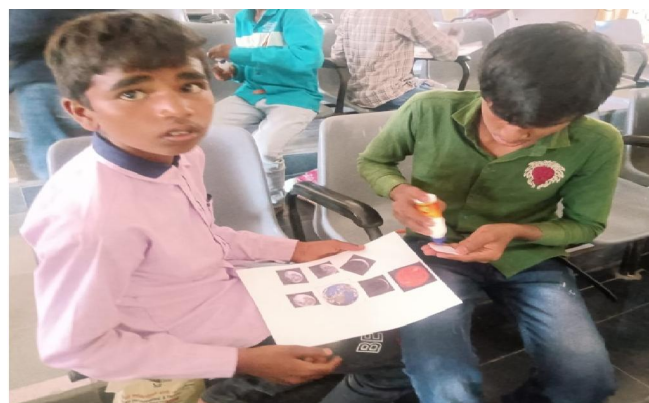
Fig 2: Students performing the activity on understanding various phases of moon