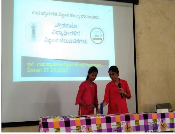
Fig 6: Student participated in the workshop