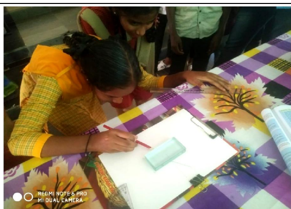
Fig 41. Demonstration of refraction of light

The programme was conducted on 07.01.2023 for students of Smt Renukadevi Sri Narasanagouda Public School, Ashapur village . A total of Ten SSLC students participated in the programme. In this programme students were made to perform activities on Reflection & Refraction.