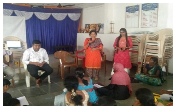
Fig 17. Participants expressing their opinion about the programme.