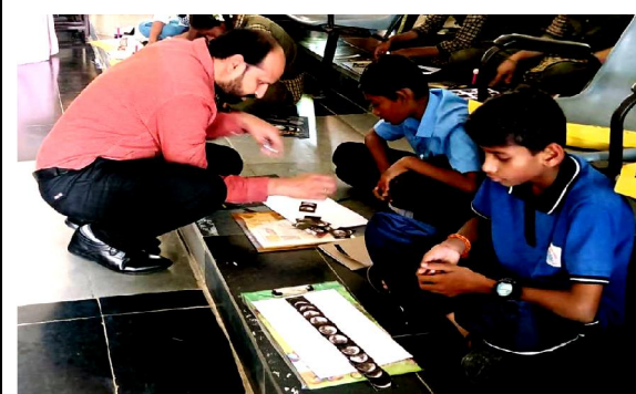
Fig 13: Students actively participated in the activities