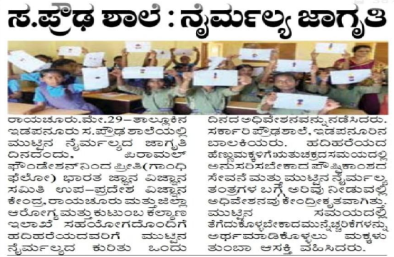
Fig 9: News article about the Programme