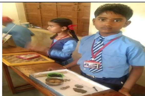
Fig 59. Students exhibiting the models at Govt Higher Primary School Timmapurpet