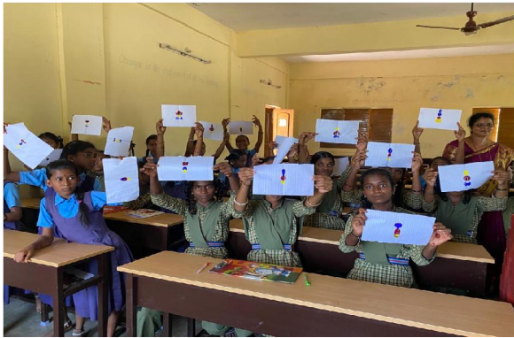
Fig 8: Student participated in the workshop

The programme was conducted on 29.05.2022 for girl students at Govt Highschool idapanur village of Raichur taluk, raichur district. 80 students participated in the programme. Sessions related to personal hygiene & healthy food habits were conducted. This programme was sponsored by Piramal foundation & conducted in association with Department of School Education & Literacy Raichur, District Health & family welfare department & BGVS Raichur.