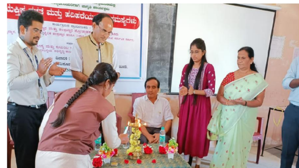
Fig 32. Inauguration of the programme