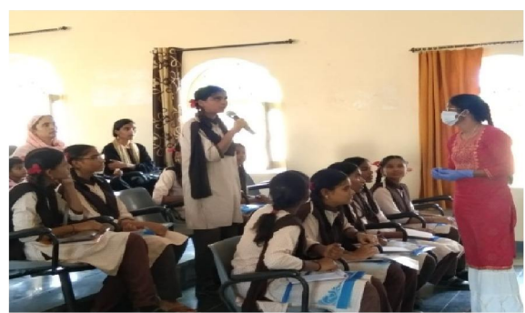
Fig 52. Students involved in activities.