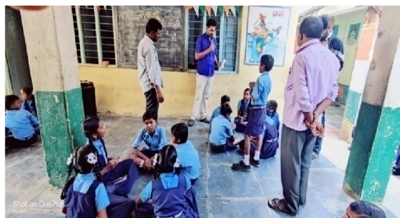
Fig 39. Science Quiz Competition Governemnet Higher Primary School Midagaladinni

The programme was conducted during the period 28.12.2023 to 31.01.2023 for students of eight Govt schools at their respective school premices. A total of 956 students participated in the programme. Under this programme various competitions were conducted to the students at their school level. This programme was sponsored by KSTePS, Bengaluru. The programme was conducted in association with Taare Zameen Pe organization and was sinked with mobile planetarium programme.