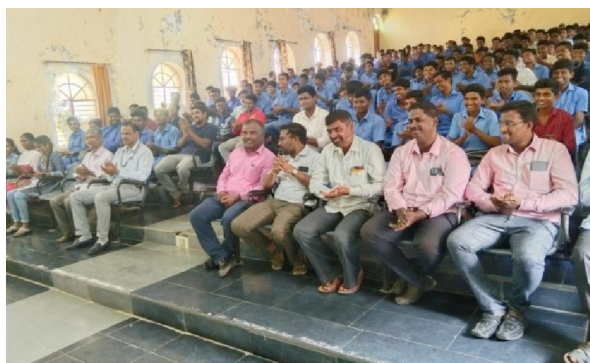
Fig 22. Paritipants in the programme

delivered by the resource persons. This programme was sponsored by KSTePS, Bengaluru. The budget spent by SRSC Raichur is Rs. 34909/- .