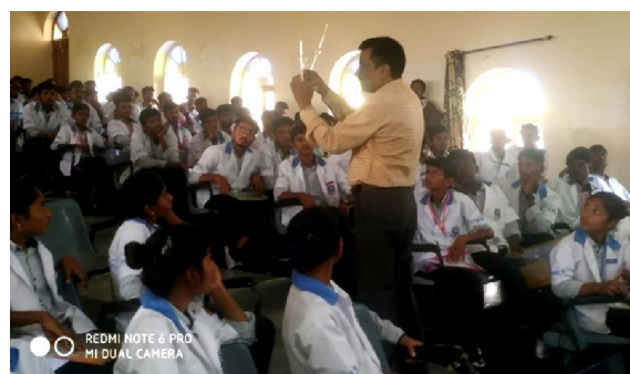
Fig 28. Demonstration related to surface tension topic