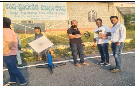
Fig 21. Distribution of book related to eclipse to the participants