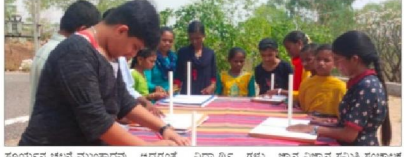
Fig 4: News article about the Zero Shadow Day

ಬಿ.ಬಿ.ಸಿ. ಸ್ಕೂಲ್‌ನಲ್ಲಿ ರಾಯಚೂರು, ಬಿ.ಬಿ.ಸಿ. ಸ್ಕೂಲ್‌ನಲ್ಲಿ ದೇಶದ ವಿಜ್ಞಾನ ಕೇಂದ್ರ ಹಾಗೂ ಭಾರತ ವಿಜ್ಞಾನ ಸಮಿತಿ ಸಹ ಯೋಜನೆಯಲ್ಲಿ ಶೂನ್ಯ ನೆರಳು ದಿನವನ್ನು ನಾಗರದ ವಿಜ್ಞಾನ ಕೇಂದ್ರದಲ್ಲಿ ಆಚರಿಸಲಾಯಿತು. ಶೂನ್ಯ ನೆರಳು ದಿನವನ್ನು ಮಾರ್ಚ್ 21ನೇ ದಿನವನ್ನು ಆಚರಿಸಲಾಯಿತು. ಈ ದಿನವನ್ನು ಆಚರಿಸಲು ರಾಜ್ಯಾದ್ಯಂತ ವಿಜ್ಞಾನ ಕೇಂದ್ರಗಳು ಮತ್ತು ವಿಜ್ಞಾನ ಸಮಿತಿಗಳು ಸಂಯೋಜಿಸಿ ಈ ದಿನವನ್ನು ಆಚರಿಸಲಾಯಿತು. ಈ ದಿನವನ್ನು ಆಚರಿಸಲು ರಾಜ್ಯಾದ್ಯಂತ ವಿಜ್ಞಾನ ಕೇಂದ್ರಗಳು ಮತ್ತು ವಿಜ್ಞಾನ ಸಮಿತಿಗಳು ಸಂಯೋಜಿಸಿ ಈ ದಿನವನ್ನು ಆಚರಿಸಲಾಯಿತು. ವಿಜ್ಞಾನ ಕೇಂದ್ರದಲ್ಲಿ ದಿನಾಂಕ 05.05.2022 ರಂದು ಸಂಭವಿಸಿತು. ಅಧ್ಯಕ್ಷ, ಅಧ್ಯಾಪಕ, ವಿಜ್ಞಾನ ಶಿಕ್ಷಕರು ಮತ್ತು ವಿದ್ಯಾರ್ಥಿಗಳಿಗೆ ಶೂನ್ಯ ನೆರಳು ದಿನದ ಬಗ್ಗೆ ಮಾಹಿತಿ ನೀಡಲಾಯಿತು. ಈ ಸಂದರ್ಭದಲ್ಲಿ ವಿಜ್ಞಾನ ಕೇಂದ್ರದ ಅಧ್ಯಕ್ಷರು, ವಿಜ್ಞಾನ ಶಿಕ್ಷಕರು ಮತ್ತು ವಿದ್ಯಾರ್ಥಿಗಳಿಗೆ ಶೂನ್ಯ ನೆರಳು ದಿನದ ಬಗ್ಗೆ ಮಾಹಿತಿ ನೀಡಲಾಯಿತು. ಶೂನ್ಯ ನೆರಳು ದಿನವನ್ನು ಆಚರಿಸಲು ರಾಜ್ಯಾದ್ಯಂತ ವಿಜ್ಞಾನ ಕೇಂದ್ರಗಳು ಮತ್ತು ವಿಜ್ಞಾನ ಸಮಿತಿಗಳು ಸಂಯೋಜಿಸಿ ಈ ದಿನವನ್ನು ಆಚರಿಸಲಾಯಿತು. ವಿಜ್ಞಾನ ಕೇಂದ್ರದಲ್ಲಿ ದಿನಾಂಕ 05.05.2022 ರಂದು ಸಂಭವಿಸಿತು. ಅಧ್ಯಕ್ಷ, ಅಧ್ಯಾಪಕ, ವಿಜ್ಞಾನ ಶಿಕ್ಷಕರು ಮತ್ತು ವಿದ್ಯಾರ್ಥಿಗಳಿಗೆ ಶೂನ್ಯ ನೆರಳು ದಿನದ ಬಗ್ಗೆ ಮಾಹಿತಿ ನೀಡಲಾಯಿತು.