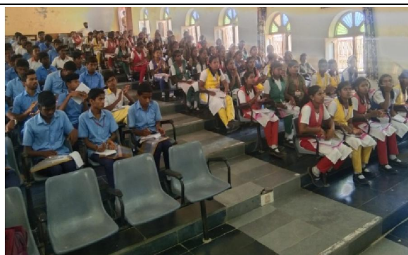
Fig 47. Participants in the programme

The programme was conducted on 10.02.2023 for students of GHS Matamari, Raichur. A total of 112 students participated in the programme. In this programme the practical demonstration related to 10 th std SSLC science subject was done and special lecture session regarding fun science, human anatomy and reptiles also conducted. This programme was sponsored by KSTePS, Bengaluru. The budget spent was Rs. 35572/-.