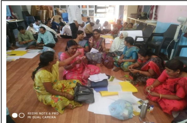
Fig 35. Teachers actively participated in the practical session

The programme was conducted on 20.12.2022 for teachers of Govt Higher primary school & High Schools at Teacher Resource Centre, BEO Office Campus, Devadurga. 46 Government school teachers of devadurga taluk participated in the programme. Sessions regarding activities & development of TLMs for students in maths subject were carried. This programme was sponsored by KSTePS, Bengaluru. The budget spent by SRSC Raichur is Rs. 16389/- .