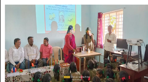
Fig 64. Students involved in School level Competitions on the account of National Science Day 2023 at Govt High School Valaballary Tq. Sindhanur.