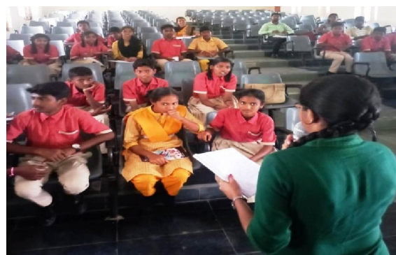
Fig 15: Glimpse of the Quiz competition