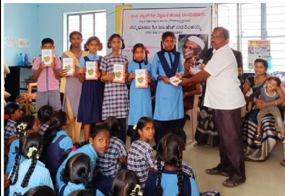
Fig 11: Winners of the competitions with the prizes