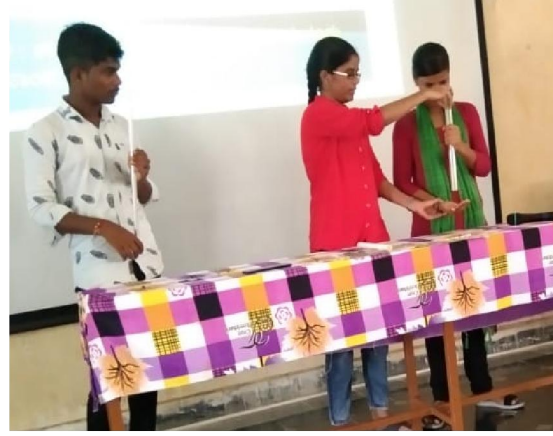
Fig 7: Students performing Physics activity in the workshop