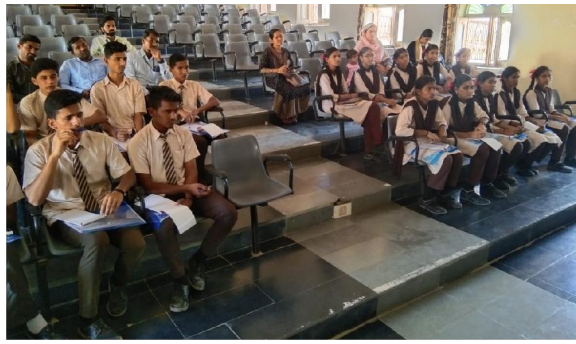
Fig 51. Participants in the programme