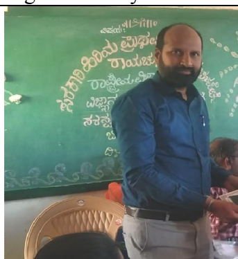
Fig 60. Glimpse of prize Distribution at Govt Higher Primary School Timmapurpet