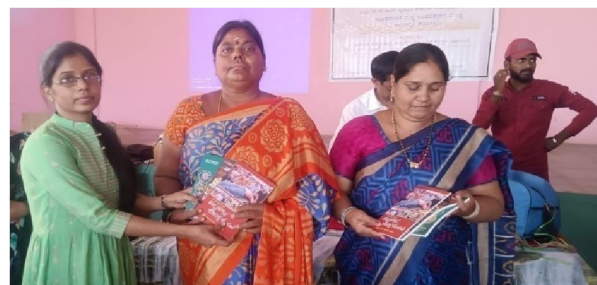
Fig 56. Distribution of books to the villagers.