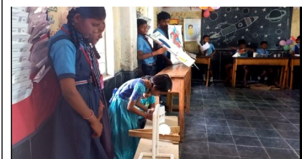
Fig 61. Students involved in School level Competitions on the account of National Science Day 2023 at Govt Higher Primary School Gonwar Raichur