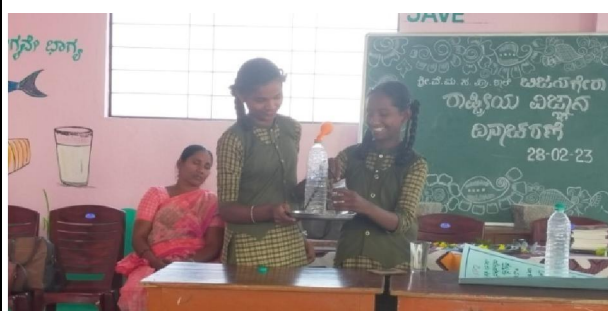
Fig 62. Students involved in School level Competitions on the account of National Science Day 2023 at Govt High School Bijanagara Raichur