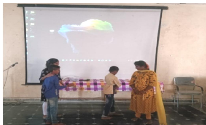
Fig 1: Activiy regarding movement of moon

The summer camp was organized at Appanadoddi village of Raichur taluk. The students were taught about, Astronomy, creativity, painting, leadership, proper usage of water & soil, & importance of science & education. The activities related to, rotation of earth around sun, rotation of moon around the earth, new moon, full moon, difference between Solar & lunar eclipse, identifying phases of moon were conducted. 55 students of appandoddi village and surrounds participated in the programme. This programme was sponsored by Piramal Foundation & conducted in association with Bharat Gnan Vijnan Samiti (BGVS).