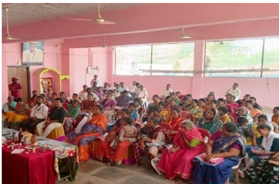
Fig 53. . Participants in the programme

The programme was conducted on 22.02.2023 at Athanur village of Sirwar Taluk. A total of 85 members comprising of farmers and home makers of Sirwar, Athanur, Shakhapur and Jakkaladinni villages participated in the programme. The session mainly focused on explanation about types of superstition and blind belief followed in these villages. Sessions about Food adultration and environmental friendly farming were also conducted.