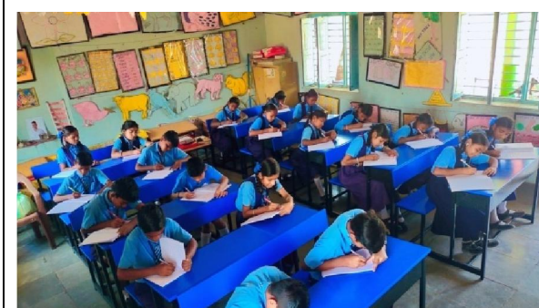
Fig 63. Students involved in School level Competitions on the account of National Science Day 2023 at Govt Higher Primary School Mushtoor Tq. Manvi