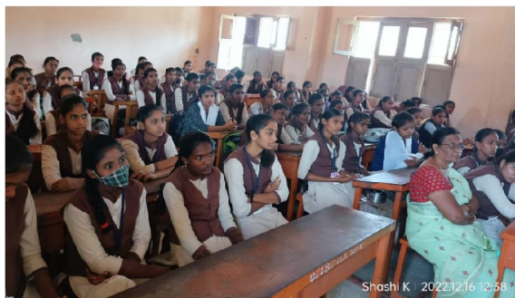
Fig 31. Participants in the programme

The programme was conducted on 16.12.2022 for students of Govt Pre University College Girls at Sub Regional Science Centre Raichur. 109 students from Govt Pre University College for Girls, Munnurwadi Raichur participated in the programme. Sessions regarding Personal Health & Hygiene & problems of Adolescent Girls were carried. This programme was sponsored by KSTePS, Bengaluru. The budget spent by SRSC Raichur is Rs. 11374/- .