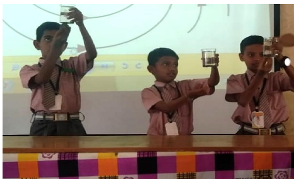
Fig 44. Students involved in activities.