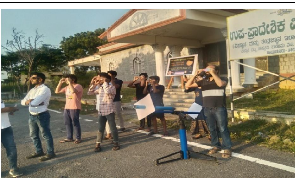
Fig 20. Observation of the sun during the Solar eclipse thru solar filter goggles

The programme was conducted on 25.10.2022 for general public at Sub Regional Science Centre Raichur. 20 members participated in the programme and observed the phases of sun during the eclipse thru sun projection system and solar filter goggles. Special lecture regarding eclipse was also delivered. This programme was sponsored by KSTePS, Bengaluru.