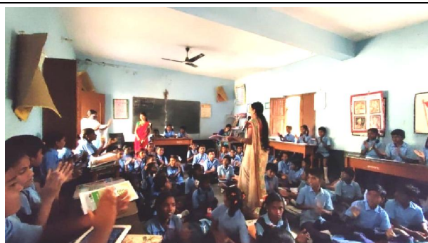
Fig 40. Science Quiz Competition at Governemnet Higher Primary School K.M.C Gunjhalli